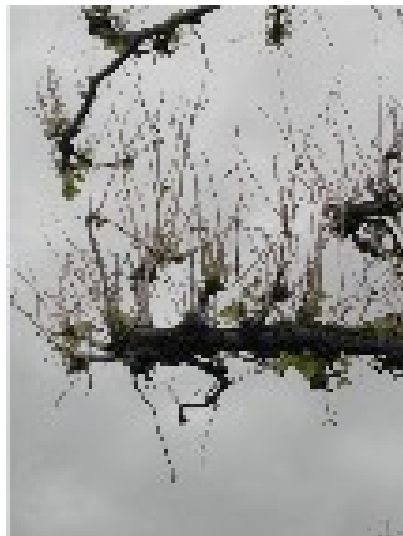
Salt damage to Basswood

trees. There was also hail reported but it is not yet known if this resulted in tree damage. Two days later, shortly after the laundry was hung to dry, a thunderstorm and shower hit the village of Angus. A bolt of lightning took out a nearby eastern white pine.